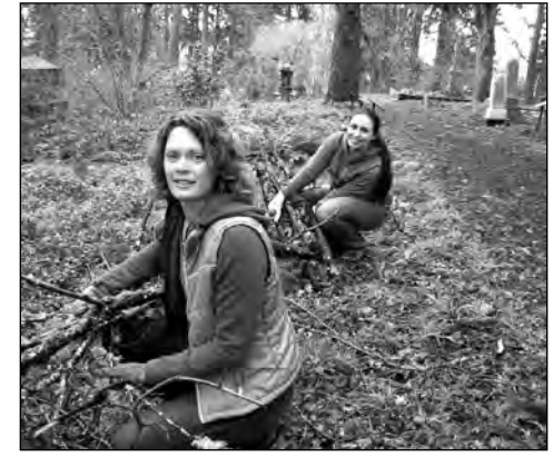
Cleaning up after Storm

work with others to make lasting landscape improvements while preparing the cemetery for an important holiday.