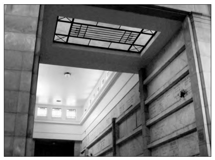
Ceiling Relight Window

Through special gifts we have also completed five larger windows on the east wall and two very large ceiling relight windows. The most difficult problem was the design for the ceiling relights since there were no records of any kind to show us the original design. John Rose was able to develop an interpretation of what the windows may have looked like. When installed, they were a perfect fit with the mausoleum.