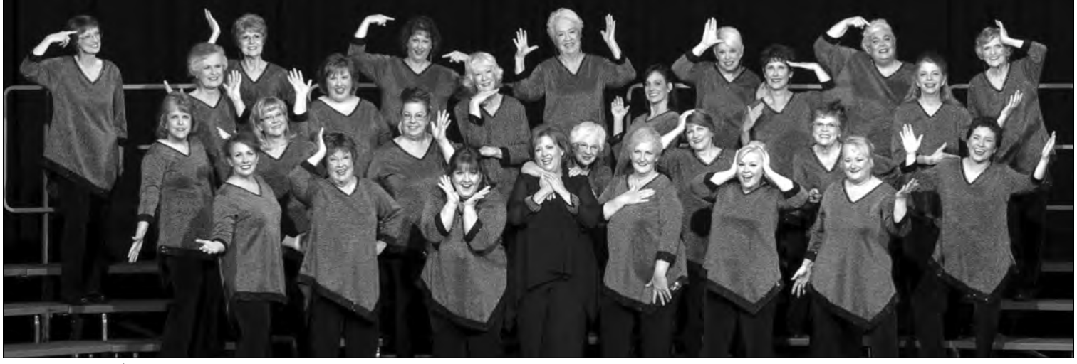
Greater Eugene Chorus