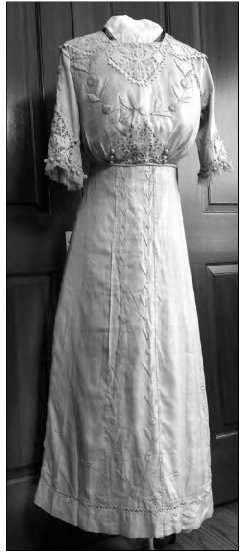
1914 Shantung Silk Dress