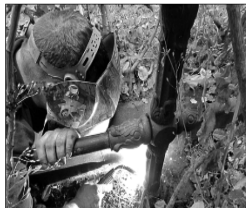
Welder at work