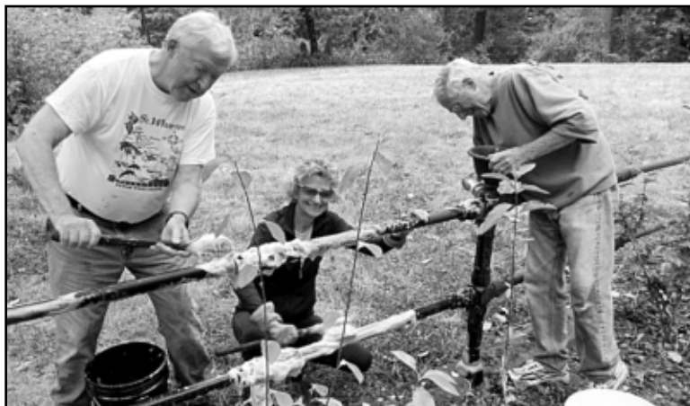
Board volunteers cleaning fence