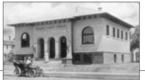
The Eugene Public Library was built in 1906 as the first Carnegie Library in Oregon.

Tombstones have been stolen or destroyed. The beautiful amber glass windows and spacious skylights in the mausoleum have been bricked up for a generation.