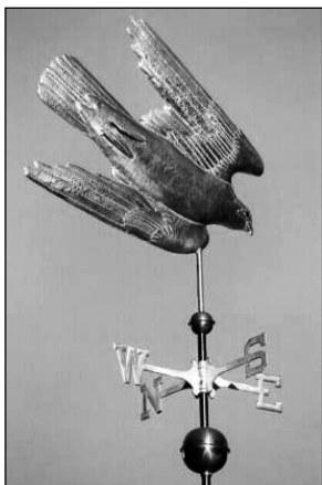
A Peregrine Falcon Weather Vane

EMCA would like to crown the cemetery's garden shed with an old-fashioned weather vane. Built in 2002, the garden shed was modeled on Jacksonville