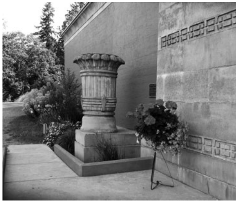
Wheelchair-accessible Entrance Porch

these ten acres look like in 2159 and how will they be used? Barbara Cowan's article (page 3) provides some clues about the physical landscape. But what about the business side of the operation? What needs to be done to continue maintaining the landscape, Hope Abbey, and the cemetery's historic significance for the tercentenary celebration? Many, if not most, of the problems in past years resulted from neglect or indifference caused by lack of funds, lack