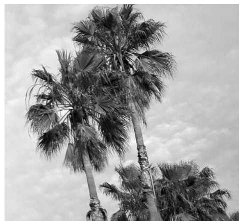
2159: Palm Trees?