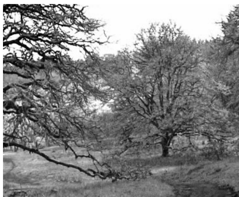
1859: What the site may have looked like

Last year when the Masonic Cemetery celebrated its sesquicentennial, the cemetery's landscape looked very different than it did in 1859. In particular, the Douglas-fir canopy did not exist 150 years ago. Similar to Skinner Butte, the hilltop was once an open meadow.