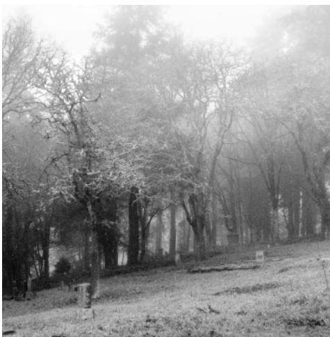
2009: Douglas fir canopy

Interestingly, Bruce, Whitey, and David all thought a natural disaster, such as a strong south wind, a major earthquake, or perhaps even a fire, was more likely to occur—and