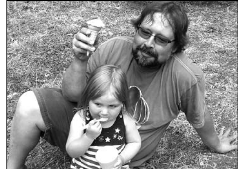
Ice cream lovers