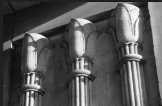
Precast concrete detail from Hope Abbey Mausoleum, built 1913-14.

Hope Abbey is once again an operating mausoleum. Crypts, niches and window memorials are now available for purchase. For more information, please contact the Eugene Masonic Cemetery at (541) 684-0949.