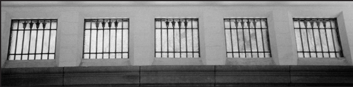
Replication of the original golden glass is in progress.