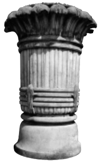
Precast concrete urn with lotus blossom appliqué.

“Mausoleum” takes its name from King Mausolus of Halicarnassus, for whom his wife built a magnificent tomb in 353 BC. The tomb is one of the seven wonders of the ancient world. Mausoleums became fashionable in late 19th century America as knowledge of and enthrallment with antiquity swept the country, and tycoons