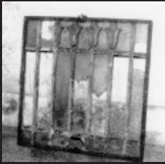
Broken clerestory window