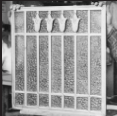
Repaired clerestory window

The endowment fund for Hope Abbey's maintenance was, alas, totally inadequate. The Portland Mausoleum Company went out of business in 1929, and the Masons had no crypts left to sell for income. Over the years, the building fell into serious disrepair with a leaking roof, groundwater seepage, broken clerestory windows, and graffitied bronze doors and walls.